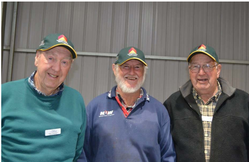
Some of the Tallygaroopna Men's Shed members.