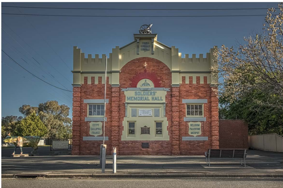
Tallygaroopna Soldiers' Memorial Hall