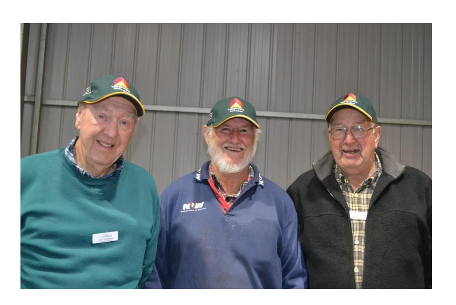
Some of the Tallygaroopna Men's Shed members.