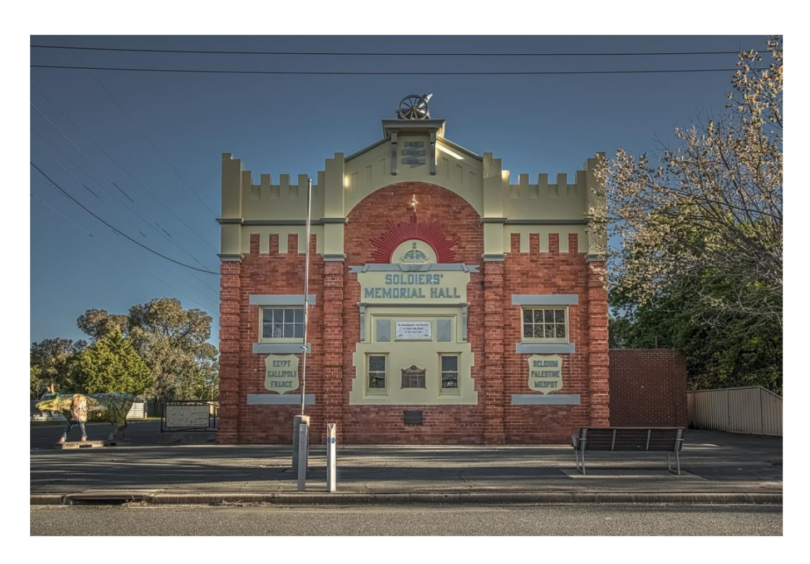
Tallygaroopna Soldiers' Memorial Hall