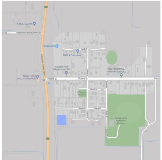
Shepparton is 16km's south of Tallygaroopna