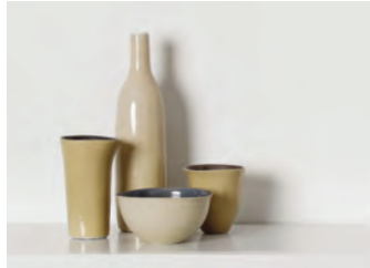
A collective, a cluster or village of elements that express internal shifts in program