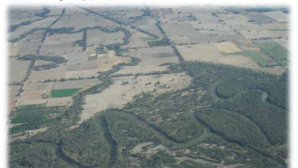
Figure 4: Native vegetation and animal habitat in the City of Greater Shepparton is mostly restricted to waterways and road reserves. These "environmental corridors" or "biolinks" are providing vital connectivity opportunites for native species across our landscape. Scattered remnant paddock trees provide "stepping stone" connectivity for our native species. The removal of any tree, especially on private land or road reserves, greatly reduces movement opportunuities for our already struggling native species.