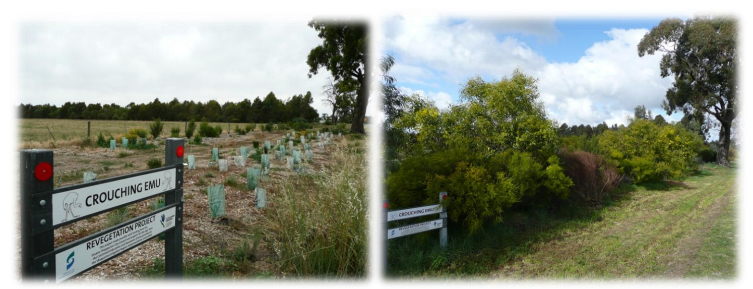
Figure 9: The acheivements of the Crouching Emu Revegetation Project demonstrate the significant outcomes possible when the State Government, Council and our community work in partnership to improve our local environment. These photos show that significant environmental improvements are possible over very short time periods. This roadside was planted in 2008 (left) whilst the photo on the right was taken three years later (2011).

Many barriers and enablers for improving environmentally sustainable behaviours and outcomes in our region lie outside of Council's direct control. Council will endeavour to strengthen our partnerships with government agencies and key stakeholders to advocate for environmental improvements for our region and beyond.