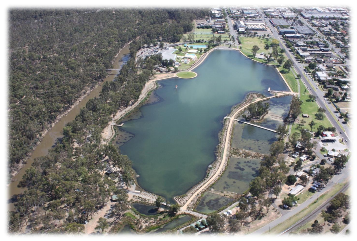
Figure 1: The redeveloped Victoria Park Lake (photo taken February 2012), was the equal fourth most valued environmental asset identified in the community environmental values survey (2011).

Section Four contains the four-year Strategy Action Plan (2014-2017) to commence achieving the Strategy's objectives. The action plan will be updated every four years as part of the Strategy review process and reported against annually.