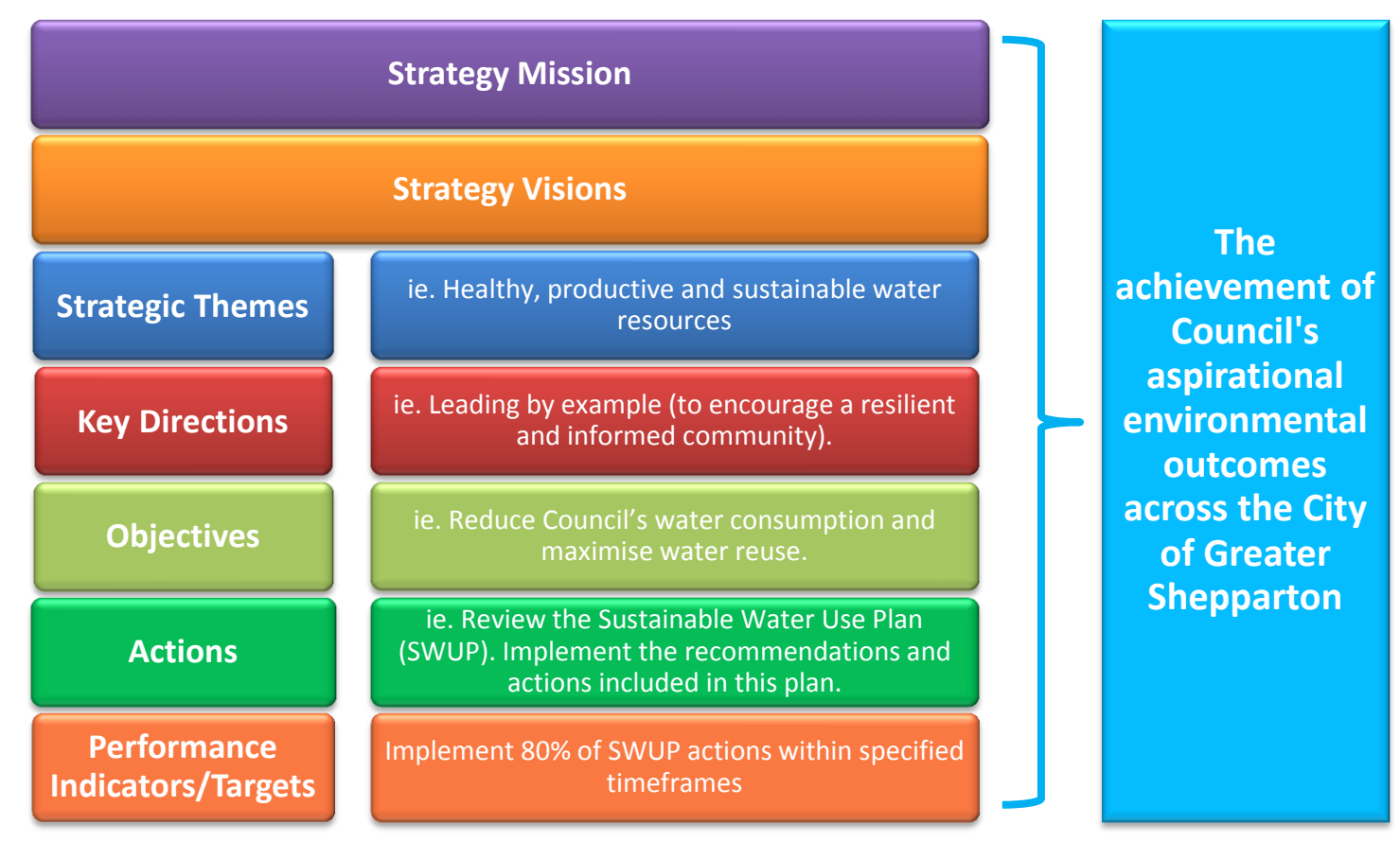
Figure 8: The strategic framework heirarchy for the Environmental Sustainability Strategy

Specific actions to achieve the strategy's objectives are outlined in Section Four, the Strategy Action Plan. The action plan contains actions to be implemented across the next four years to achieve the major objectives of the Strategy. The four-year action plan will be updated as part of the Strategy review process that will occur every four years.