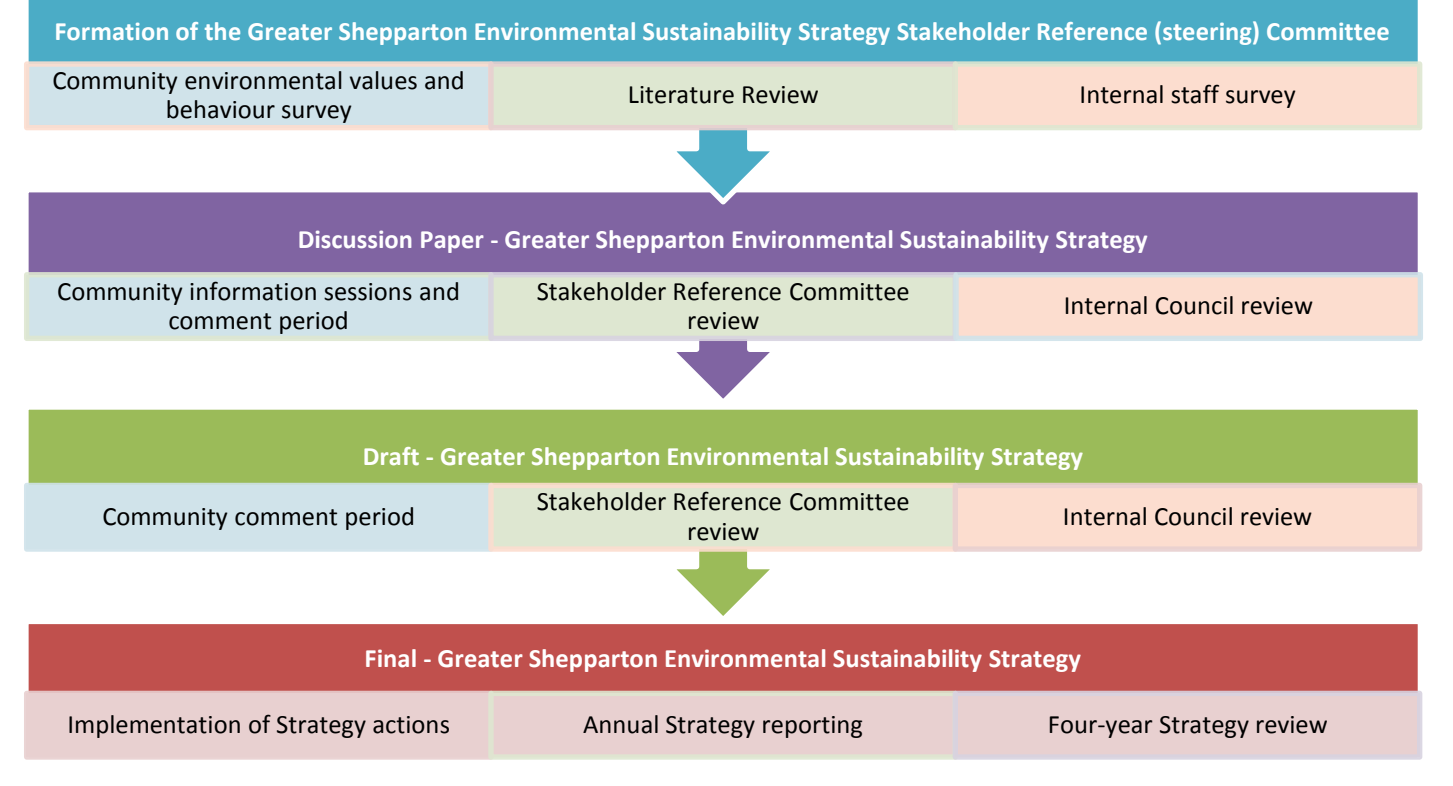
Figure 5: Greater Shepparton Environmental Sustainability Strategy – development process

Eighty-five submissions were received during the discussion paper community consultation period. These submissions contained over a thousand specific comments, largely relating to local environmental management issues and how Council can achieve positive outcomes on these matters. Some of the key messages from the community consultation process are outlined in the "Our community and their major environmental concerns" chapter (page 14). A companion "What you said" report on the community feedback received is also available on Council's website.