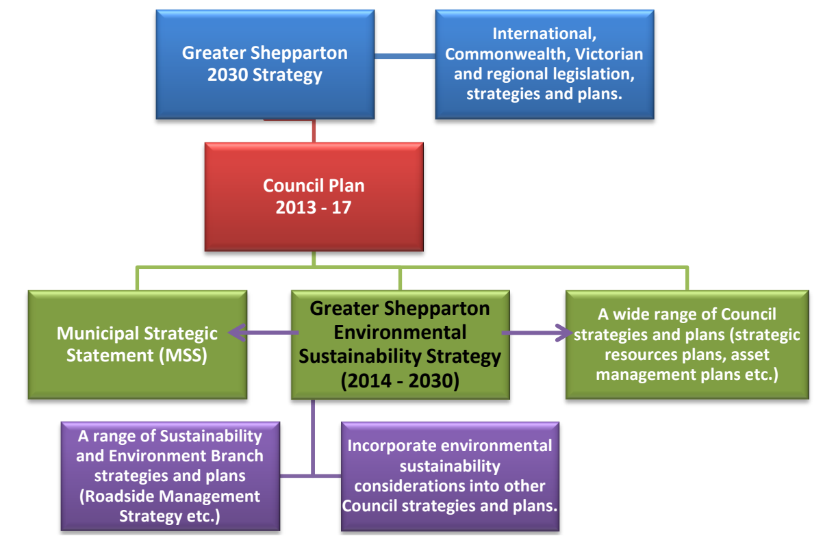
Figure 6: Hierarchical overview of where the Greater Shepparton Environmental Sustainability Strategy will sit within Council's existing strategic structure. Arrows indicate that the Strategy will incorporate environmental sustainability consideration into the MSS and other Council strategies and plans.

Figure 6 (below) provides a hierarchical overview of where the Environmental Sustainability Strategy sits within Council's strategic structure.