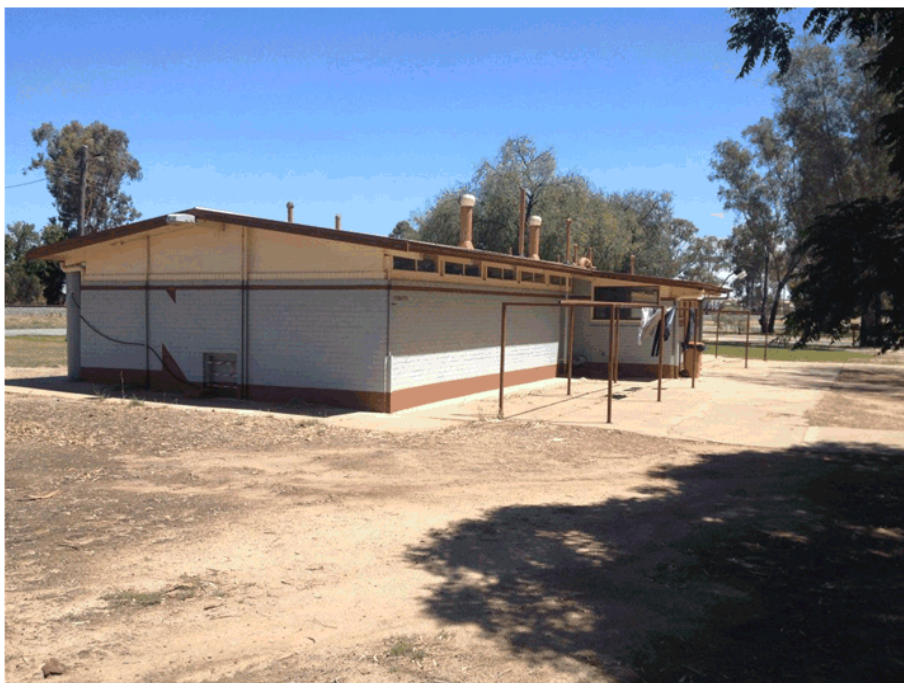
The first abluion block built 1968/69 is now rundown and out-dated for a family park amenity block.