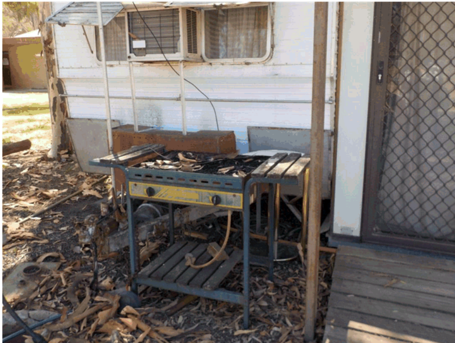
One of the poorly kept annual sites.