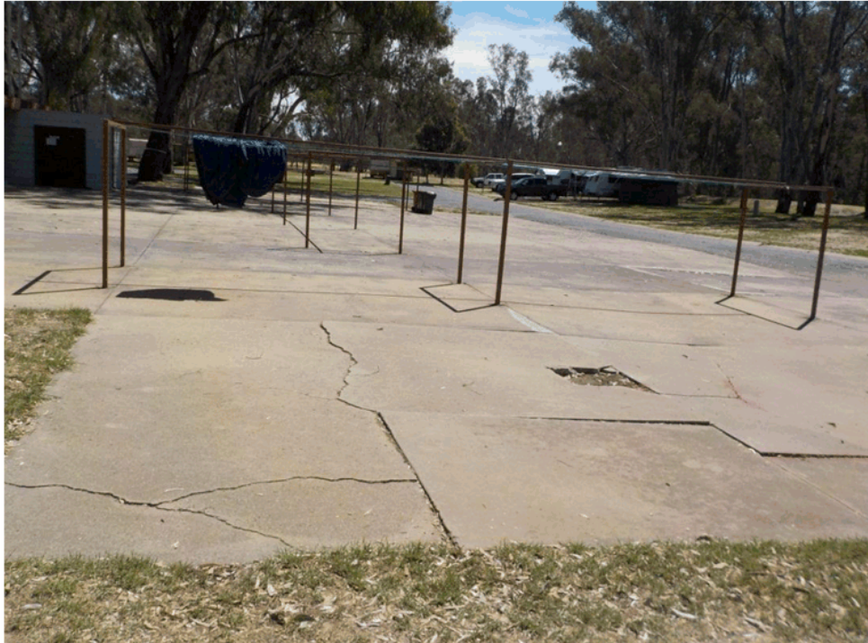
Various trip hazards and poorly designed clothes line which pose significant OHS issues to visitors

A site inspection of the park in November revealed a significant number of serious maintenance requirements and potential health and safety risks associated with the aging infrastructure, and unless addressed, maintenance will only continue to increase, and the risk of an accident to a resident is a very real prospect.