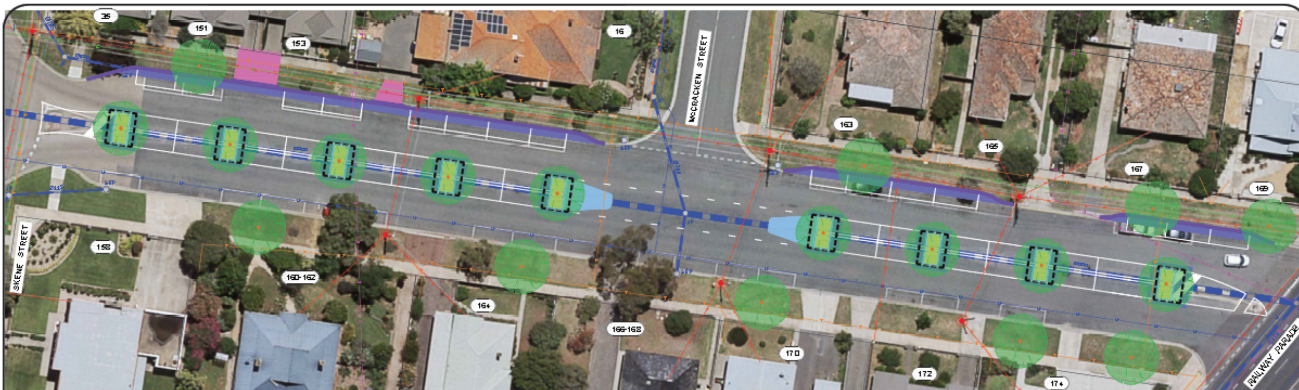
CONCEPT LAYOUT PLAN SCALE 1:50