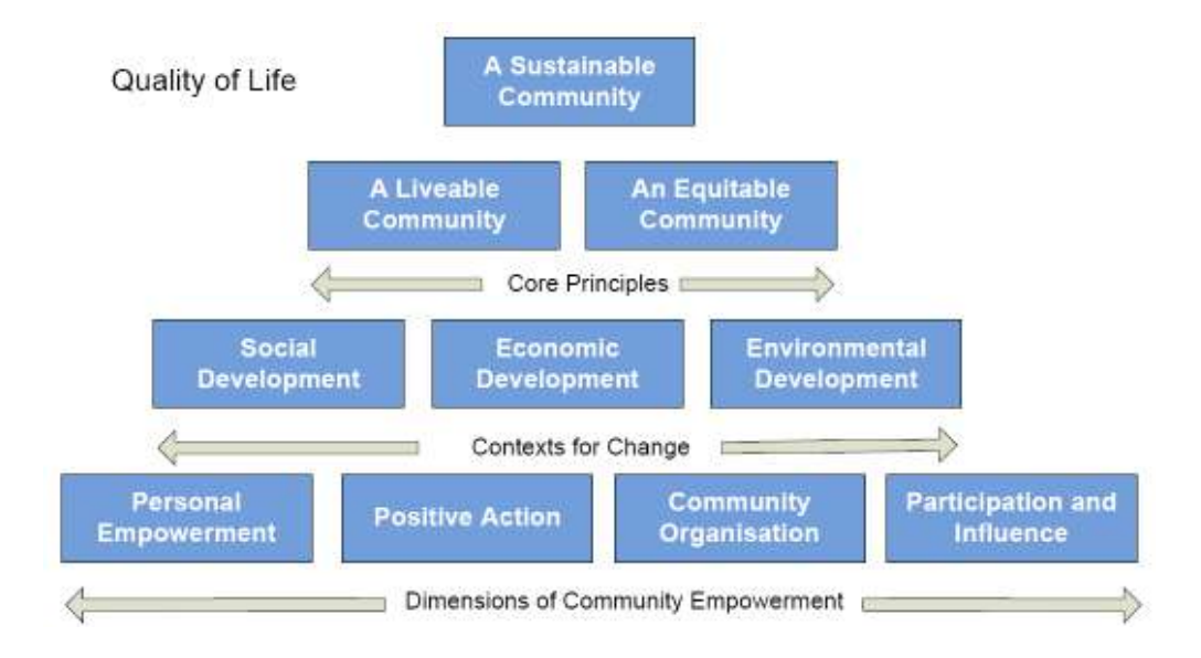
ABCD Model