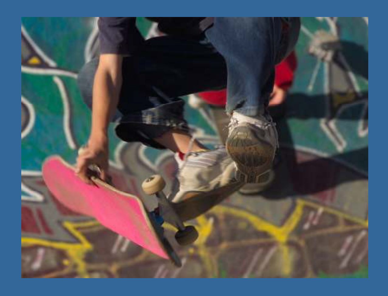
Section 3: Translating Vision into Action

"Unless commitment is made there are only promises and hopes, but no plans" -Peter Drucker