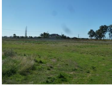
Subject site – View north-east over subject site towards Ford Road and adjoining residential development