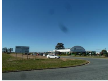
View south-east from Numurkah Road over subject site towards 219 Numurkah Road