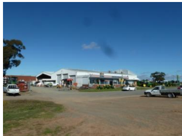
Doody Street – View towards adjacent site at 219 Numurkah Road (south)