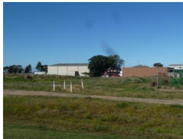
Subject site – View south-east towards nearby development (child care centre is currently proposed in this location)