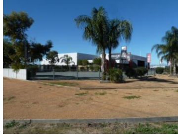
Ford Road – Adjoining property at 231 Numurkah Road (north-west of the subject site)