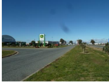
View south-east from Numurkah Road over subject site towards 219 Numurkah Road