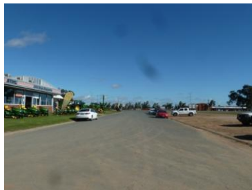
View west along Doody Street