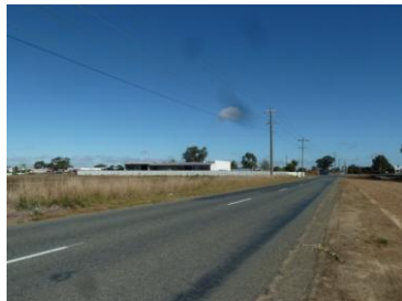
Ford Road – View towards adjoining property at 231 Numurkah Road