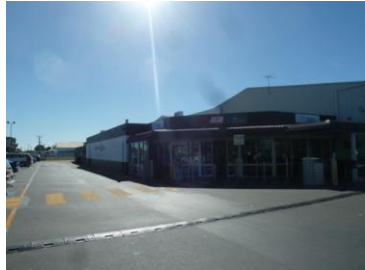
Existing IGA to the south of the subject site at 193 Numurkah Road