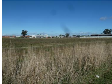
Ford Road – View south-west from northern site boundary towards Doody St and adjoining property