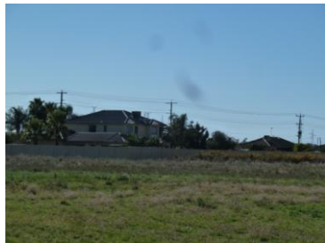
Subject site – View north-east over subject site towards Ford Road and adjoining residential development