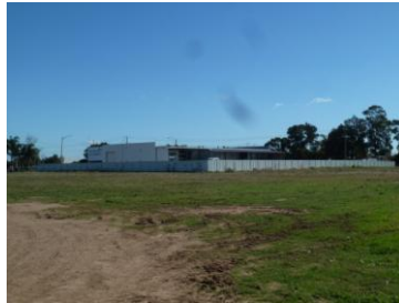
Subject site – View north-west towards 213 Numurkah Road (across subject site towards adjoining property)