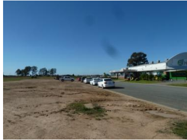
View south-east from Numurkah Road over subject site towards 219 Numurkah Road