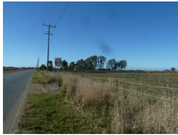
Ford Road – Northern site boundary looking east along Ford Road

A site visit was undertaken on 8 May 2017 to inspect the subject site and its surrounding context. Key images have been included below to illustrate the interface between the subject site, adjoining properties and street interfaces.