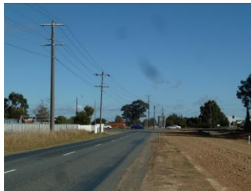
Ford Road – View towards Ford Road-Wanganui Road-Goulburn Valley Highway intersection to the west of the site