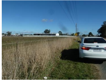
Ford Road – View towards adjoining property on the north-west of the subject site