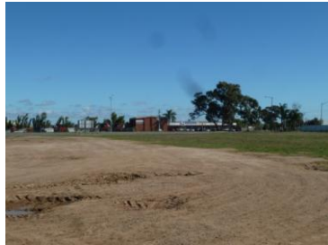
Subject site – View north-west towards 213 Numurkah Road (across subject site towards adjoining property)