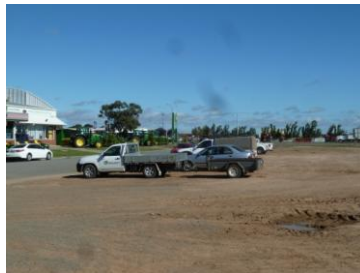
Doody Street – View towards adjacent site at 219 Numurkah Road (south-west)