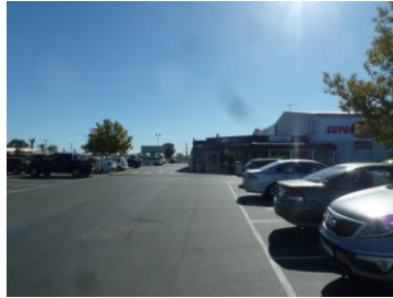
Existing IGA to the south of the subject site at 193 Numurkah Road