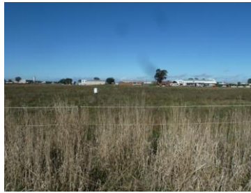
Ford Road – View south over subject site towards Doody Street