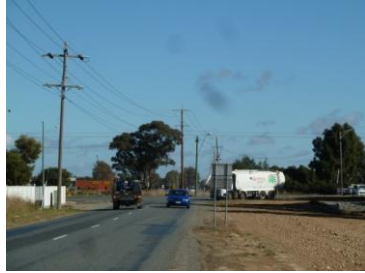
Ford Road – View towards Ford Road-Wanganui Road-Goulburn Valley Highway intersection to the west of the site