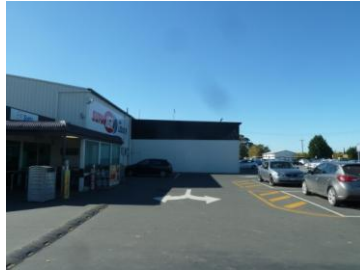
Existing IGA to the south of the subject site at 193 Numurkah Road