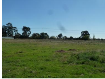
Subject site – View north over subject site towards Ford Road