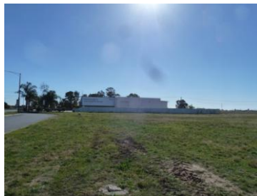
Subject site – View north over subject site towards adjoining property at 213 Numurkah Road