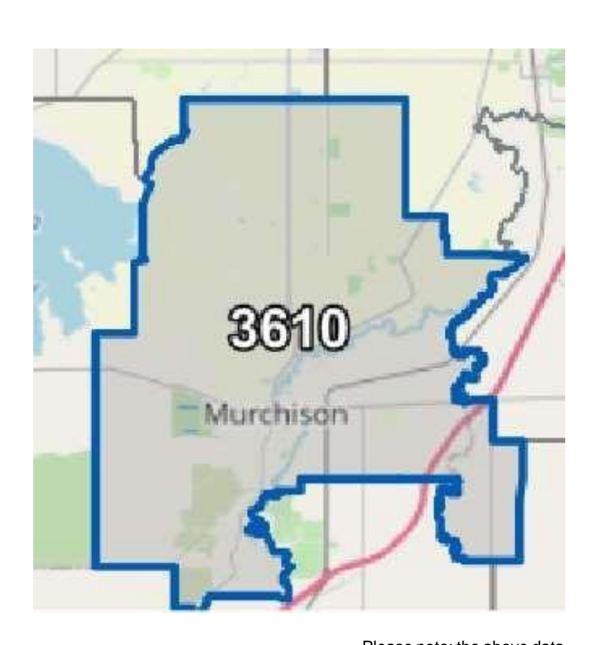
Please note: the above data (2021 census) is the most current we have at this time