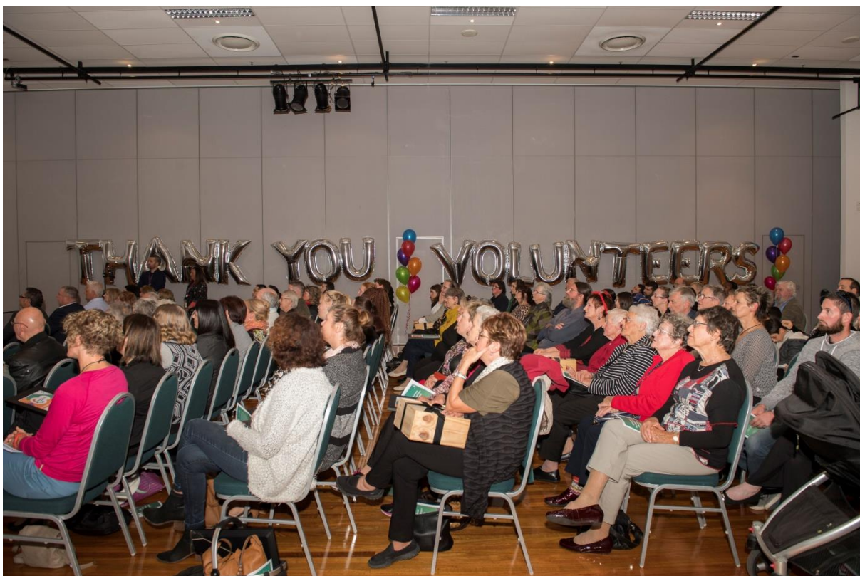
Celebrating and Recognising Our Volunteers