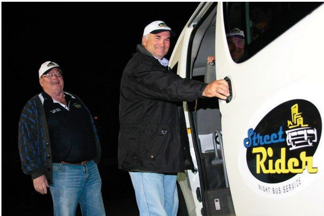
Street Rider Volunteers

(Sourced from the Australian Bureau of Statistics 2016.)