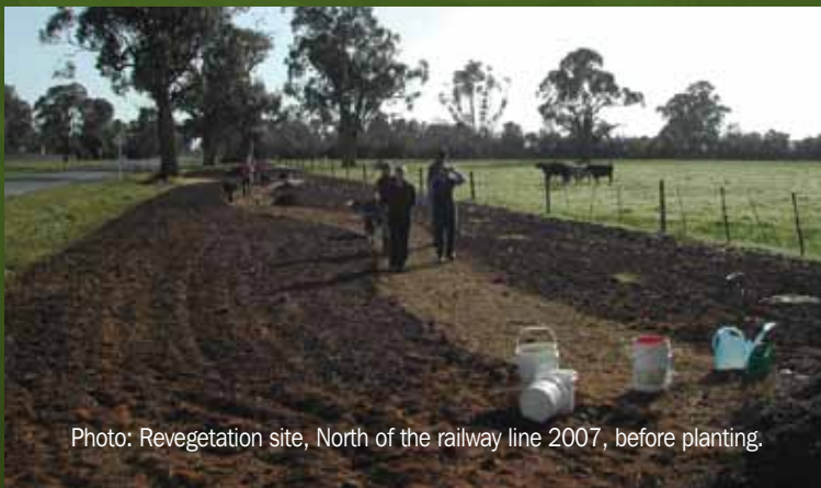
Photo: Revegetation site, North of the railway line 2007, before planting.

Goulburn Broken Catchment Management Authority Residents and landholders along Dhurringile Rd Tatura Community Landcare Volunteers Tatura Primary School Sacred Heart Primary School Bethel Christian College Mooroopna Secondary College Mission Australia National Green Jobs Corps work crew Tatura Area Community Bulletin The Tatura Guardian