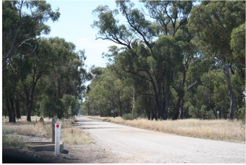
*Please refer to Katandra Flood Emergency Plan for further details.