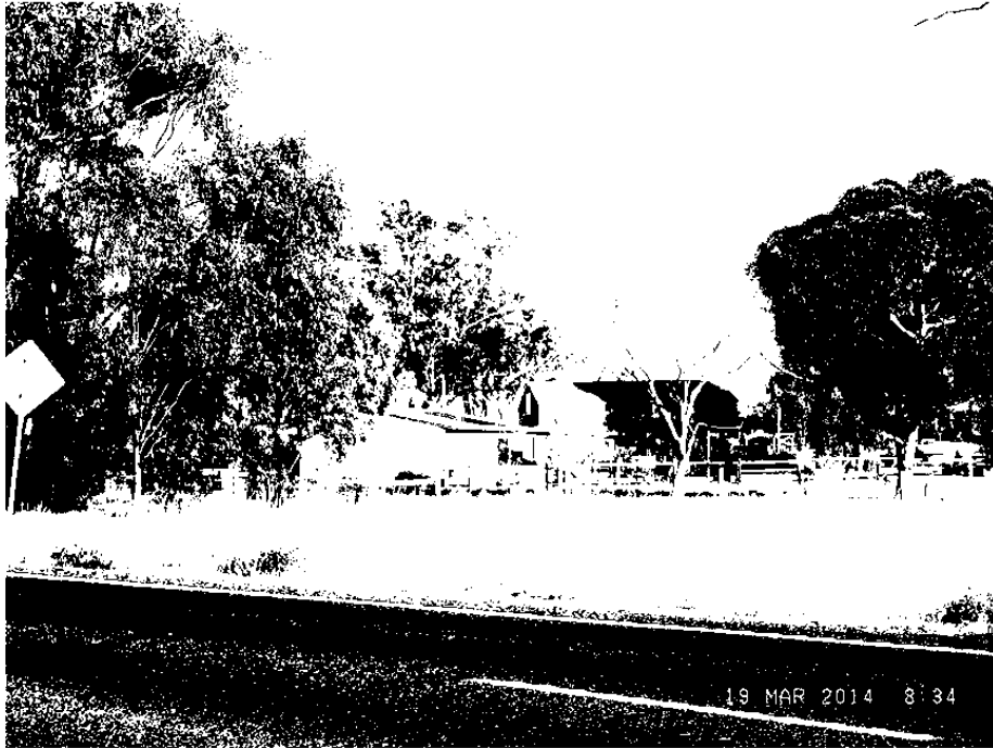
Existing shed and dwelling on the land