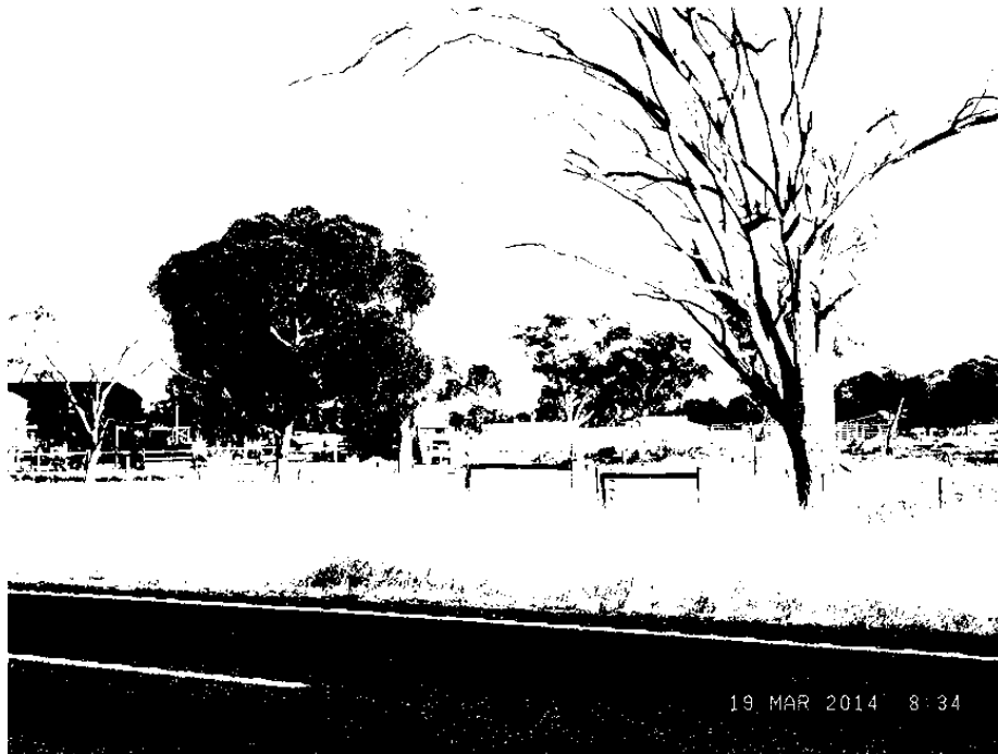
View of land and pools

The Photos below show the existing site: