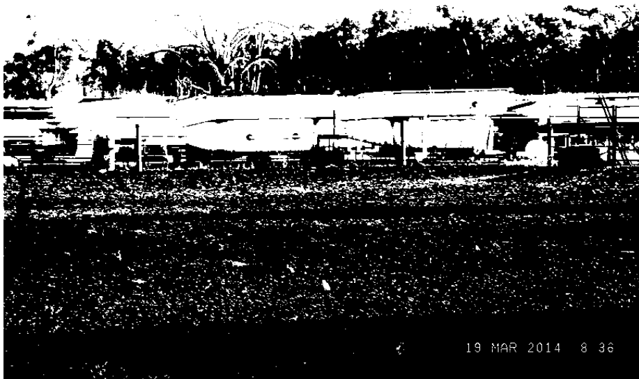
Photos of existing pools being stored