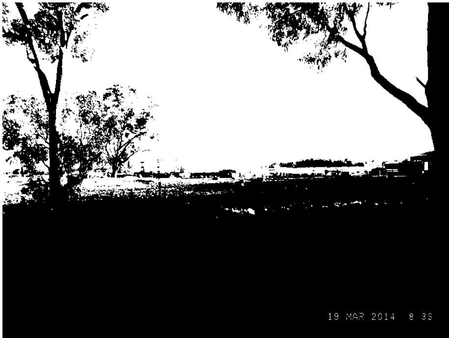
Existing paddock which holds cattle for intensive feeding