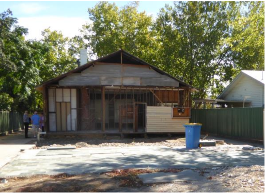
Rear elevation of the dwelling

Photos of the remaining part of the dwelling are below.