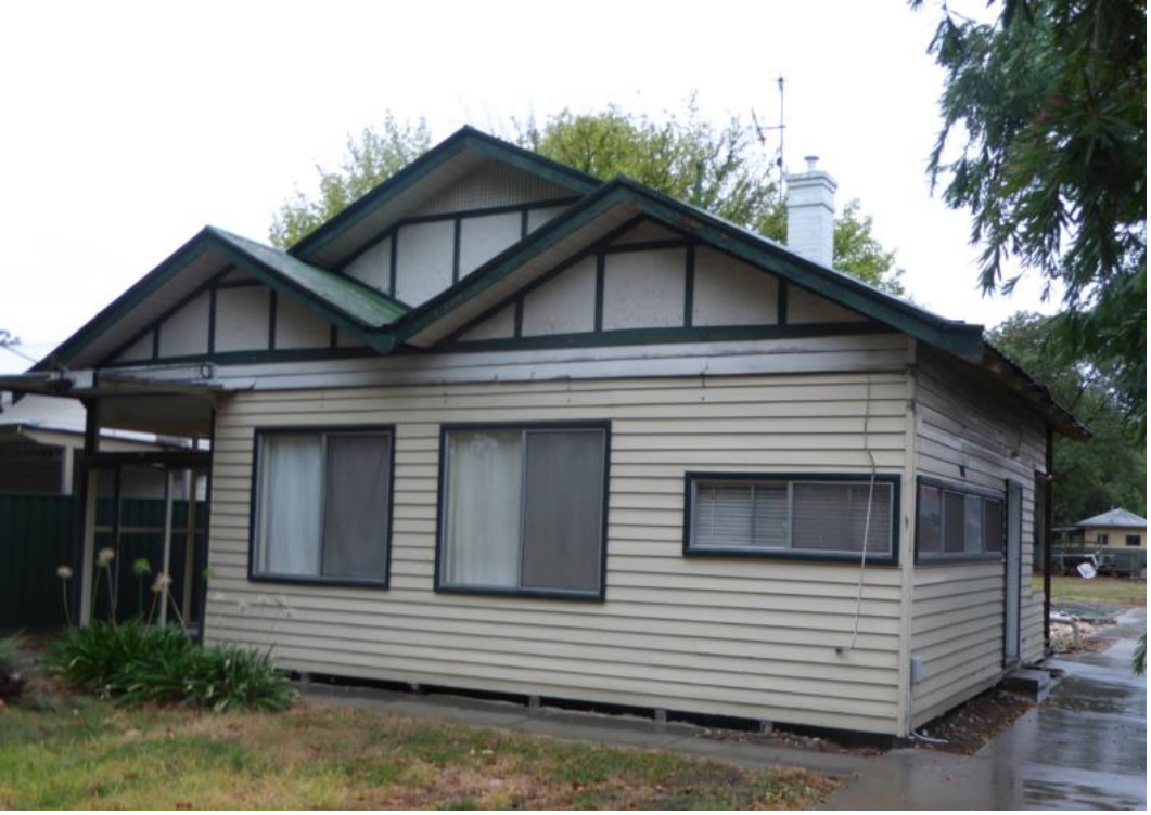
Front elevation of the dwelling