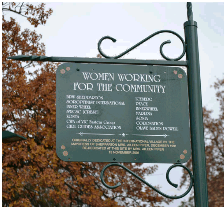
Above: One of the restored honour boards in the Queens Gardens Shepparton.

In 2001, as the International Village was no longer operational, the roses were moved to the Queen's Gardens in Shepparton along with an honour board noting the names of the award recipients.