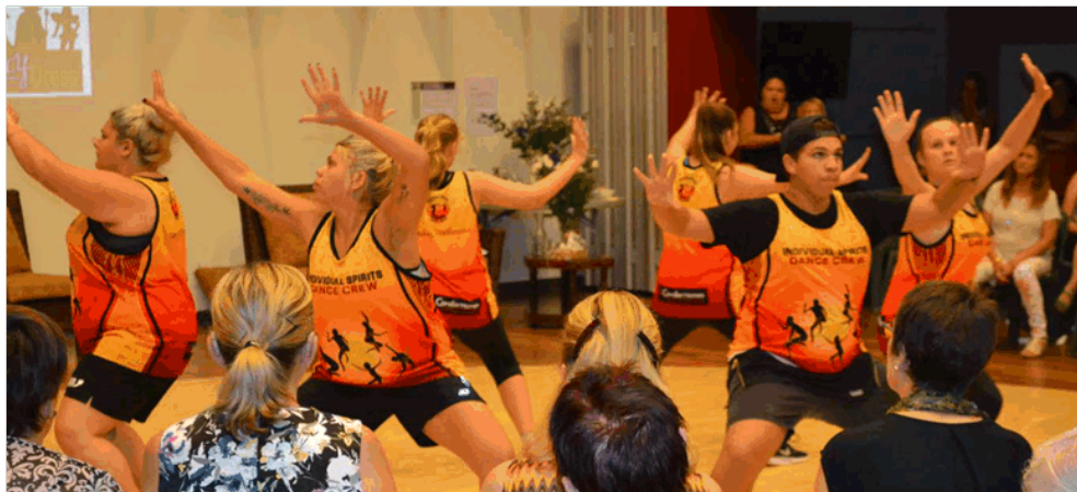
Above: The Individual Spirits Dance Crew performed at International Women's Day.

Natarsha Bamblett's Individual Spirits Dance Crew also performed.