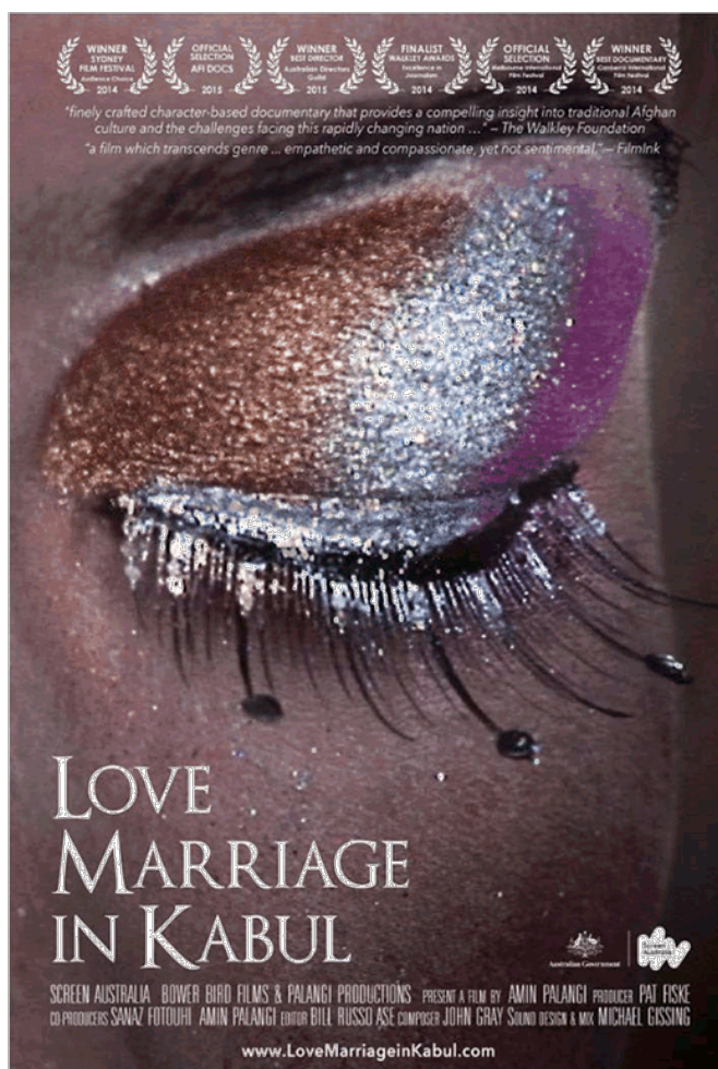
Above: The official movie poster for the documentary 'Love Marriage in Kabul'.