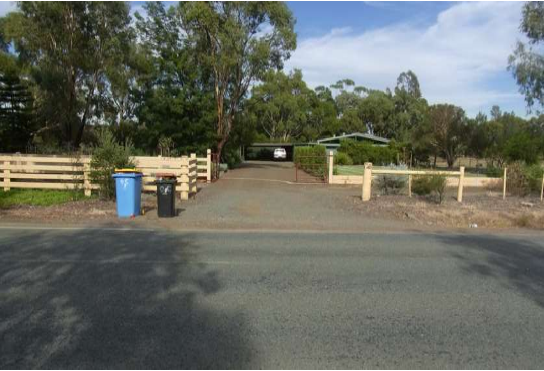
Main vehicle access to the land