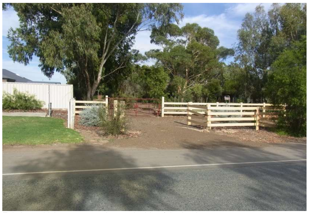
Existing vehicle access on the south side of the land

Surrounding land is predominantly rural living to the east and residential to the north, south and west. Photos below show existing vehicle crossing arrangements for the land.