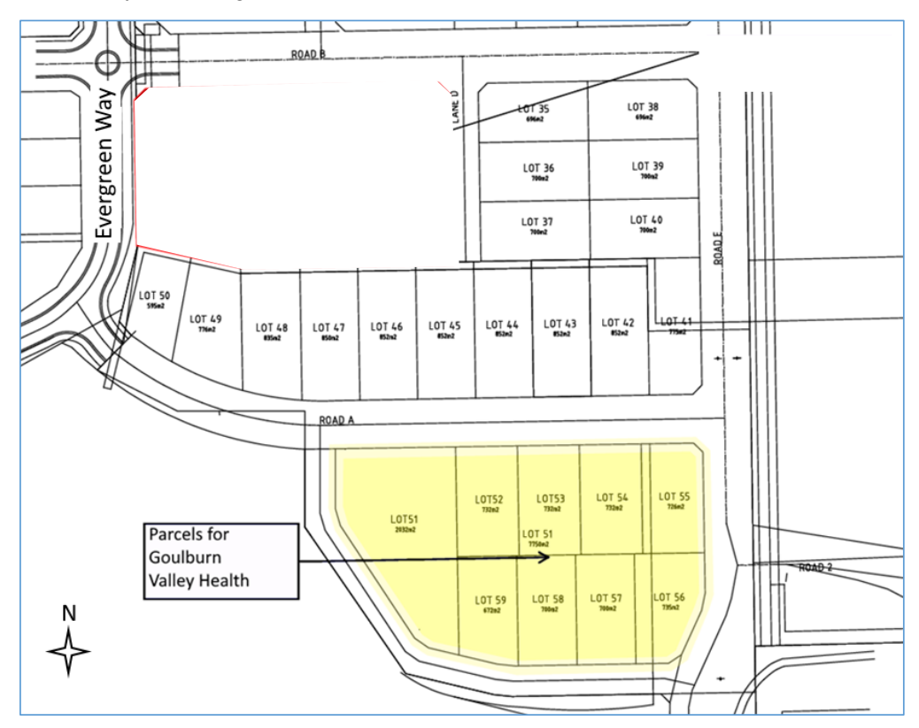
Figure Two: 45 Parkside Drive, Shepparton, proposed lots for sale to GV Health.

The purchase will involve nine lot allotments totalling 7,761m2 approximately, which is also outlined in yellow in Figure One.