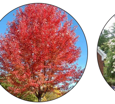
Acer x freemanii 'Jeffersred' (Autumn Blaze Maple)

Dianella revoluta 'Little Rev' (Black-anther Flax-lily) Grevillea 'Poorinda Royal Mantle' (Creeping Grevillea) Lomandra 'Tanika' (Matt-rush) Myoporum parvifolium (Creeping Boobialla) Poa labillardieri (Common Tussock Grass)