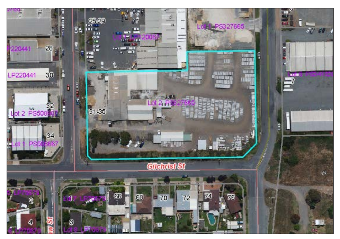
The Photos below show the existing site: