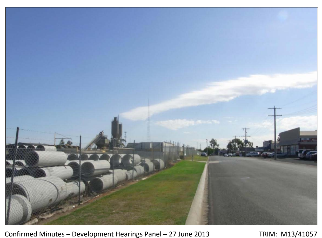
Confirmed Minutes – Development Hearings Panel – 27 June 2013