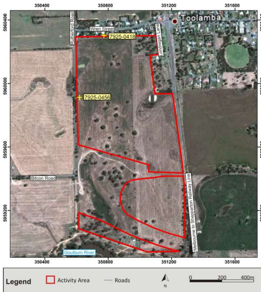
Map 5: Aboriginal Places within 200m of the Activity Area

The extent of the cultural heritage assessment – referred to as “the Activity Area” - is shown with a red outline on the image below – Figure 5 from the CHMP. This figure also shows the approximate location of two known Aboriginal sites. At Section 5.4 of the Report, it notes “There are two sites within 200m of the Activity both of which are located just outside the boundary fence. These are 7924-0418 and 0456 both of which are scarred trees (see Map 5).”