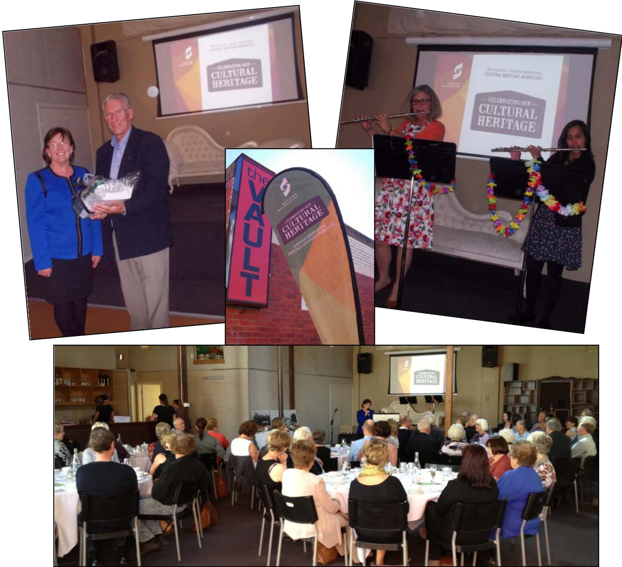
The Inaugural Cultural Heritage Awards 2013 ceremony held in The Vault, Shepparton on Saturday, 20 April 2013.

A Cultural Heritage Awards 2015 Workshop was held on Monday, 2 September 2013, reviewing the operation of the 2013 Awards and beginning to plan for the 2015 Awards.