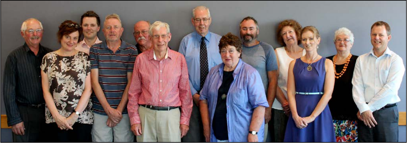
Members of the Heritage Advisory Committee at the Committee's meeting held on 03 March 2014.