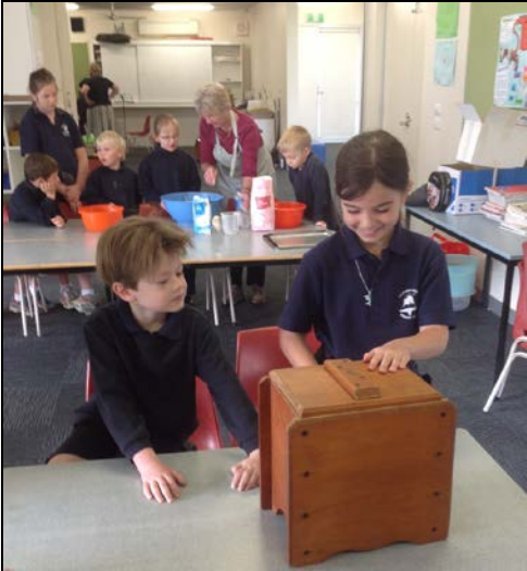
The Katandra & District History Group celebrated "History Week" by hosting a number of events: here students learn domestic skills of the past.

In October 2013, a number of member societies actively supported "History Week" - an opportunity to promote local history and discover Victoria's past.